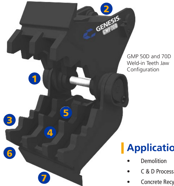
GMP 50D and 70D Weld-in Teeth Jaw Configuration