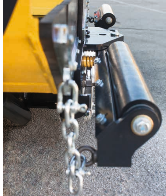
Impact-free docking – dampened bumper.