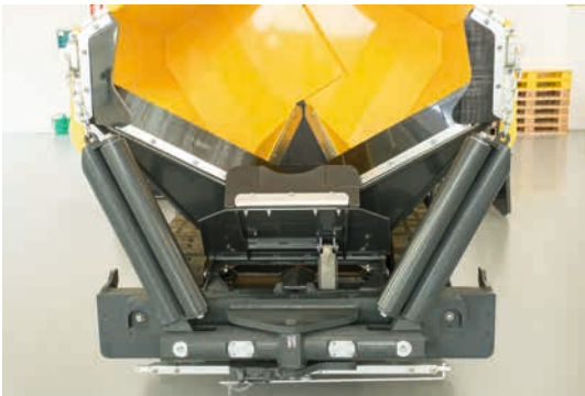
Hydraulic front gate – for a clean material flow.